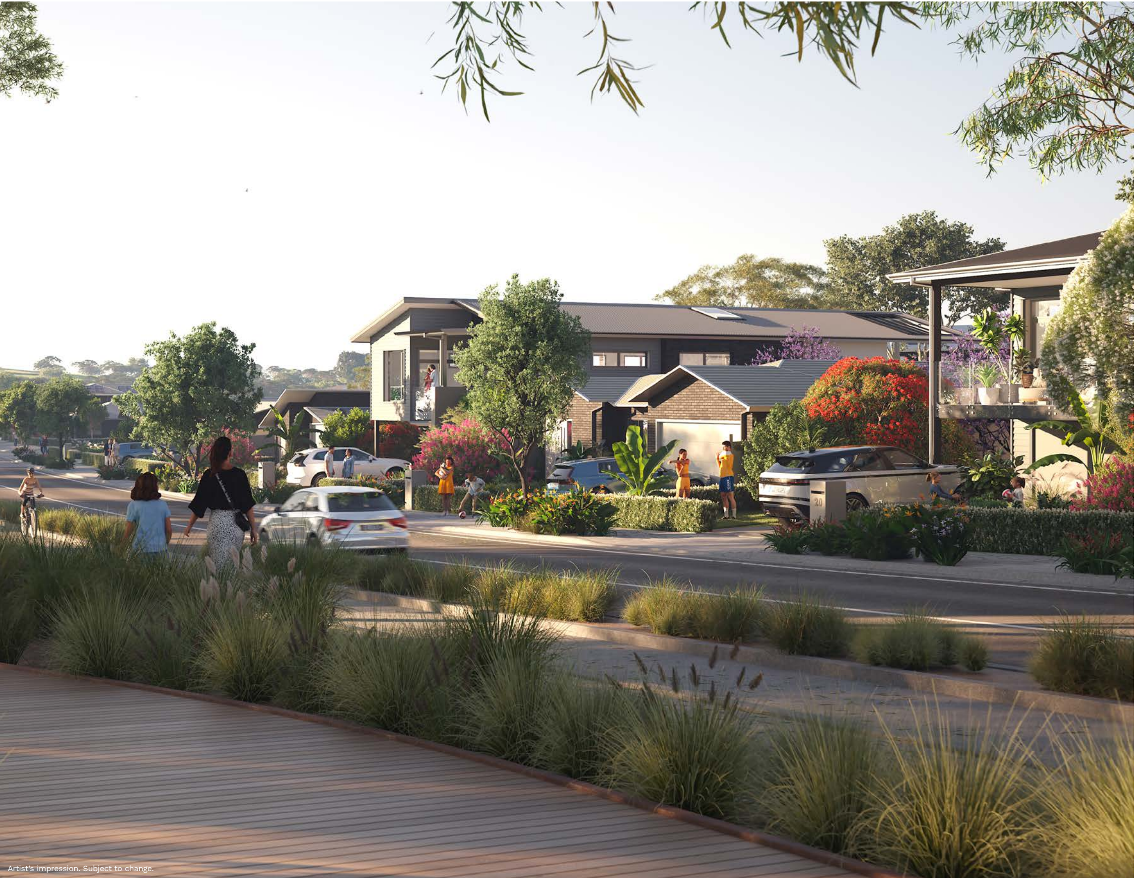
Artist's impression. Subject to change.