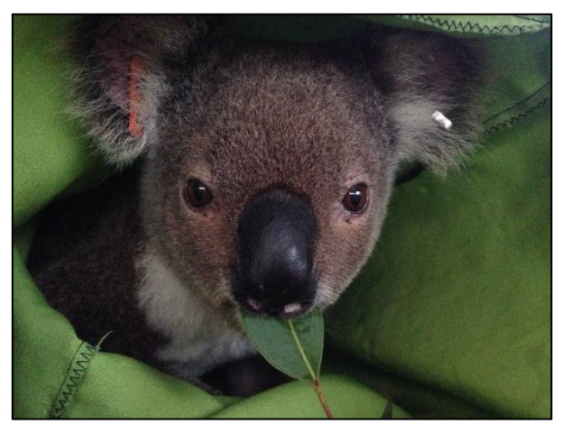
Image of Sue-Bob during examination (left) and then recovering after anaesthesia in the catch bag (above); during recovery Sue-Bob ate several eucalypt leaves that were offered to her.