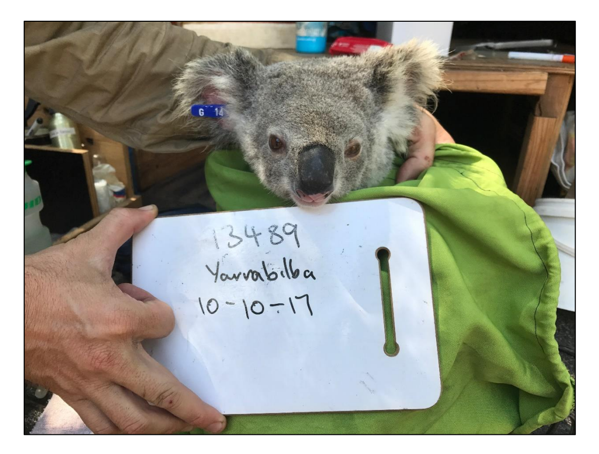
Image of Scarlet (female 13489) resting in a catch bag during processing

Scarlet was fitted with a royal blue ear tag (#G14) in her right ear, and a small metal tag in her left. She was not carrying a young but the examination of her pouch suggested that she had bred previously. Given that September to December is the main koala breeding season, it is hoped that Scarlet will conceive a young before her next health assessment (scheduled for March/April 2018).