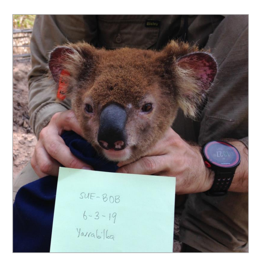
Figure 5. Image of Sue-Bob, showing the brown, thinned fur on her face and ears.

Sue-Bob was de-collared and released back up the tree from which she was captured. The images below were taken at her release.