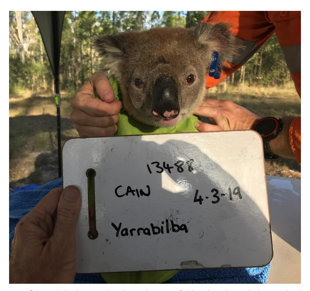
Figure 3. Image of the male koala Cain taken during the recent fieldtrip (March 2019), showing that both eyes are clear and free of chlamydial infection.

Cain was sighted during the March fieldtrip while we were searching habitat within the focal area. He was situated up a tall gum-topped box within his usual area of occupation and was able to be flagged down by our tree climber and ground team. The examination revealed Cain was in fair condition (body score 6/10) and that he had no clinical signs of chlamydial disease. Ocular and urogenital swabs were collected and later tested negative for Chlamydia. Cain had gained substantial weight (450g) since he was last examined, in January 2019. He was again fitted with a tracking collar and released at the point of capture.