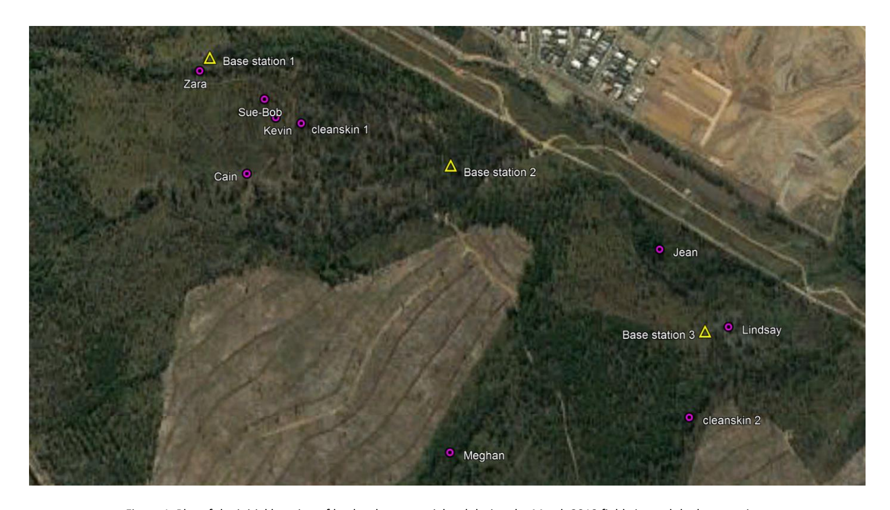
Figure 1. Plot of the initial location of koalas that were sighted during the March 2019 fieldtrip, and the base stations that have been deployed to monitor their movements.