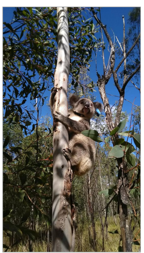
Figure 6. Images of the new sub-adult male koala (Kevin) during examination and at release.