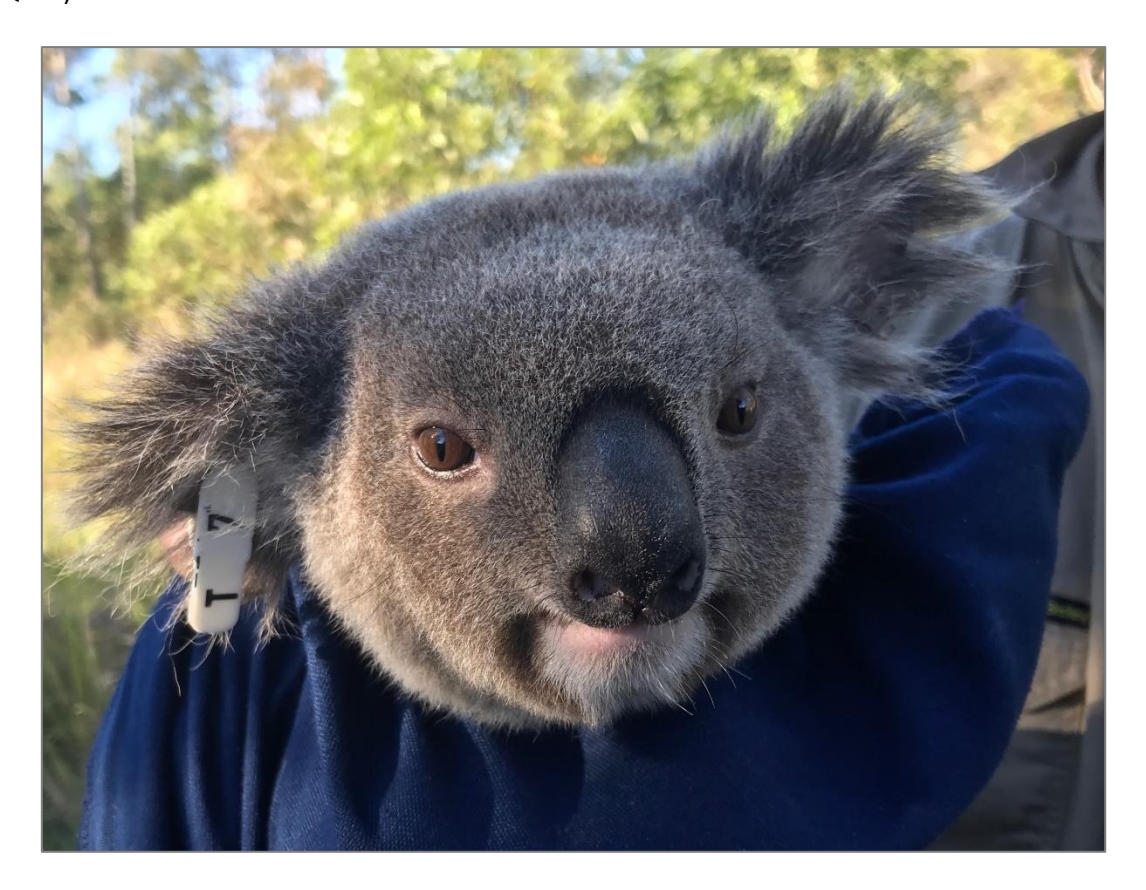
Figure 5. Image of Nyunga after fitting with white tag in the right ear; her eyes were clear.

Nyunga weighed only 3.2kg and the state of her pouch (clean, unexpanded) strongly suggested that she had not yet bred. She had very little tooth wear and was estimated to be 1-2 years old. Nyunga was in very good condition (body score 8.5/10) and did not present any signs of chlamydial infection. Eye and urogenital swabs were collected to confirm her chlamydial status (laboratory results pending). She was given one coloured tag (white T7) in the right ear and one small metal tag (UQ955) in the left ear.