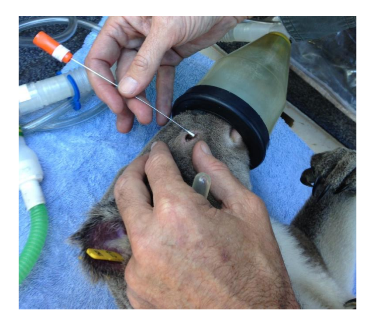
Figure 6. Image showing swab sample collection from Heath's right eye, while he was anaesthetised.

Heath was fitted with an LX collar so that his movements can be monitored via the base stations and LX website. In addition, Heath was fitted with an ear tag transmitter (Fig. 8). This light weight VHF transmitter will serve as a back-up method of locating Heath, should his LX collar fall free.