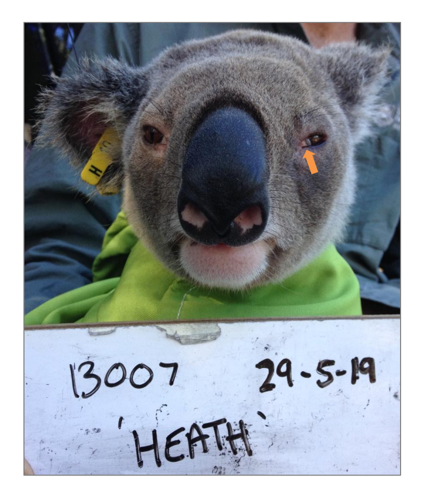
Figure 7. Heath's head picture, showing the minor inflammation of his left eye conjunctiva (orange arrow).