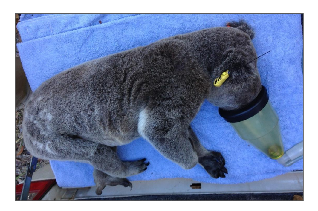
Figure 8. Image showing the ear tag transmitter fitted to Heath's right ear, with the black aerial protruding.