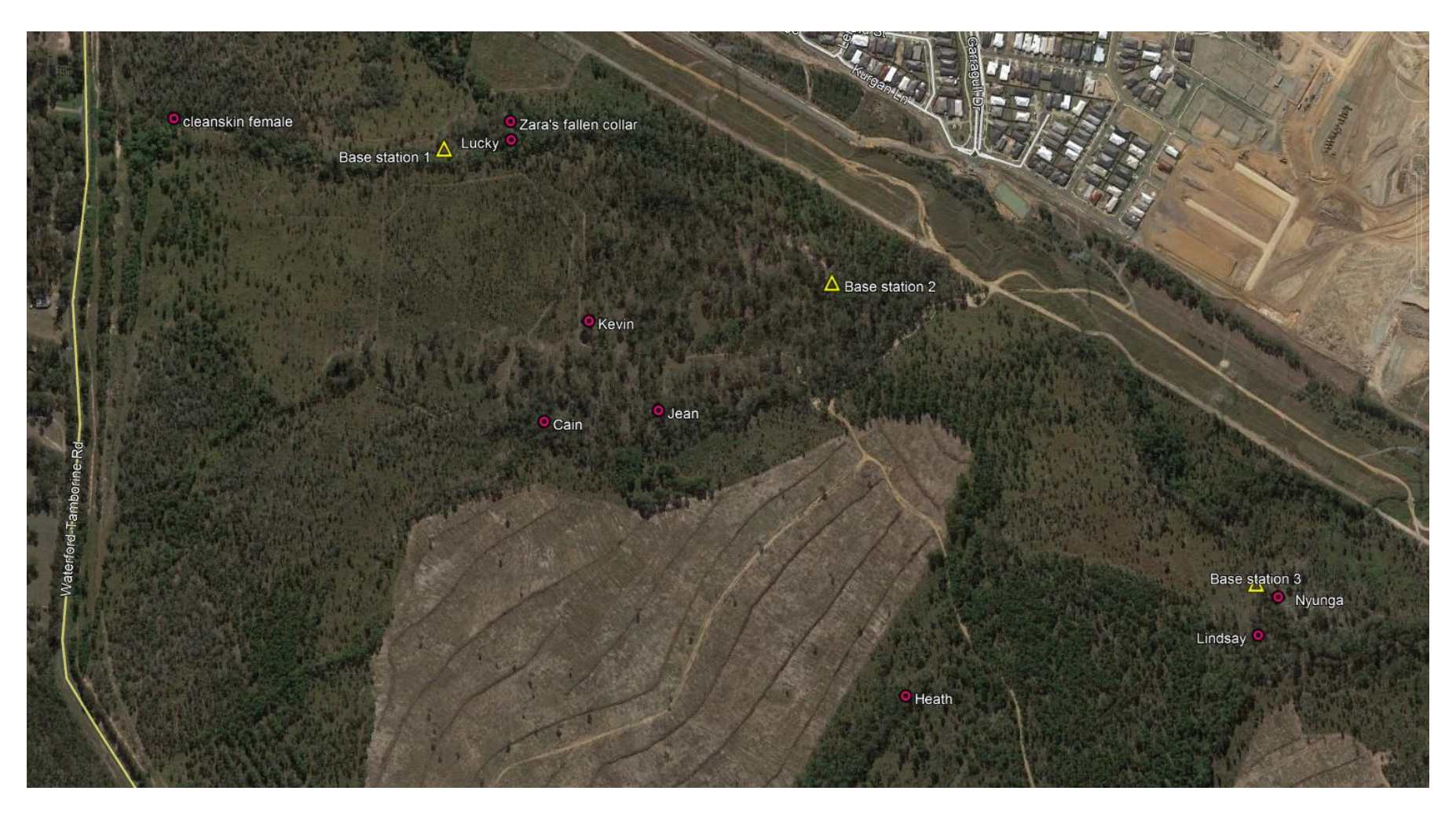
Figure 1. Plot of the initial location of koalas that were sighted during the May 2019 fieldtrip, and the base stations that have been deployed to monitor their movements.