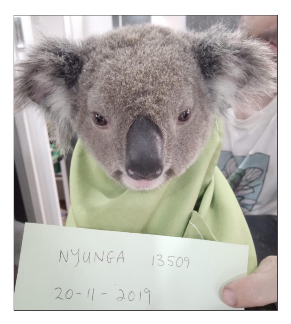
Figure 7. Image of Nyunga after fitting with white tag in the right ear; her eyes were clear.

Given that Nyunga weighed more than 4kg, her collar was swapped to an LX collar so that her movements can be monitored remotely. She was released at the point of capture up a small ironbark.