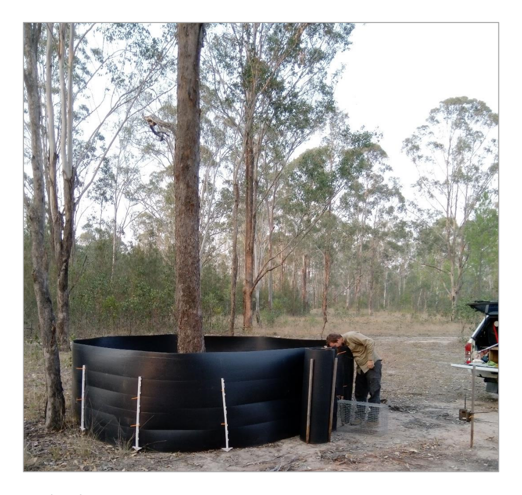
Figure 3. Image of the fence trap that was set up to try and catch male koala Cain; an SMS motion-sensor camera (bottom right) was used to send an immediate alert if the koala entered the trap.