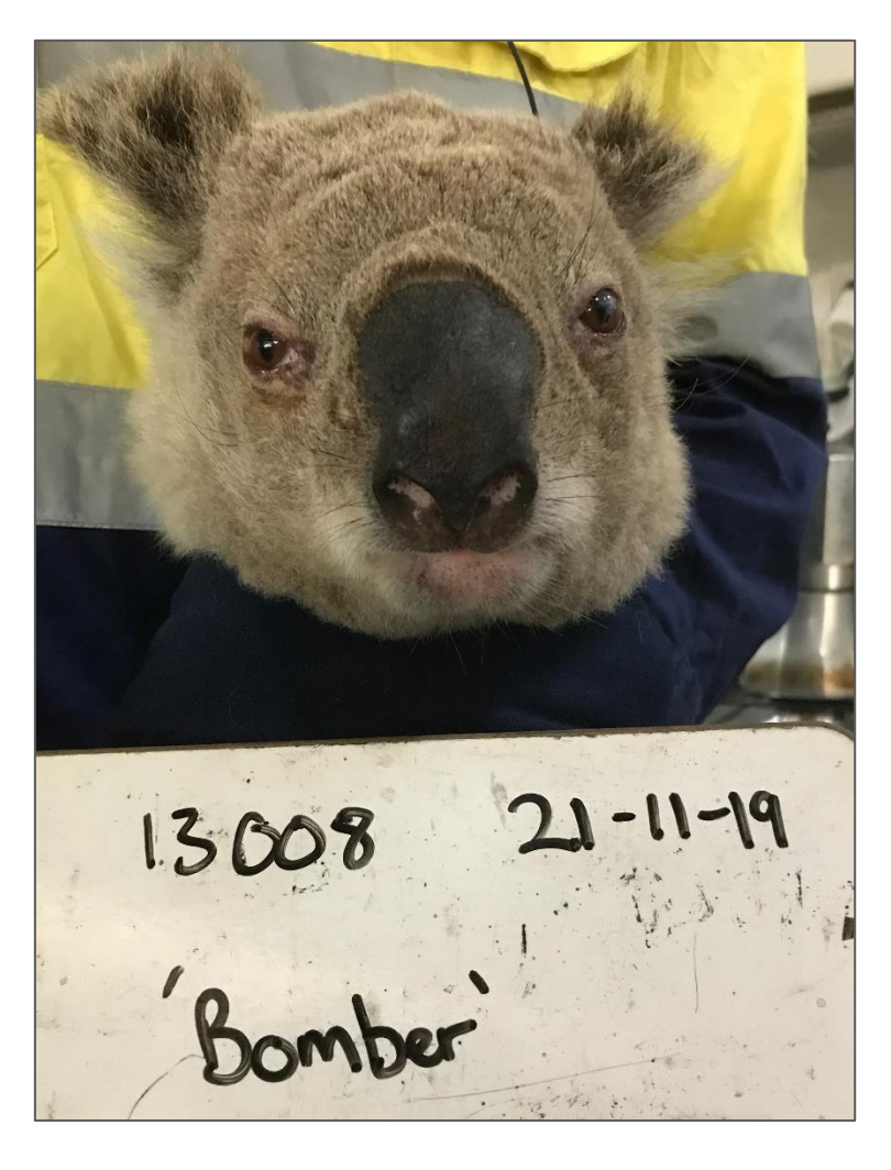
Figure 5. Image of Bomber showing that his eyes were clear and free of obvious infection.

Bomber has lost approximately 1kg since July 2019 (now 8.05kg) and his overall body condition score had decreased (5/10 vs 6/10 in July). This may be the result of the dry spell at the site or due to his older age. Bomber's eyes were clear (Figure 5) and he did not present any obvious signs of disease. Swabs were collected from Bomber's eyes and urethra and sent for laboratory testing (results pending). He was fitted with a standard LX collar and an ear tag transmitter before being released at the point of capture.