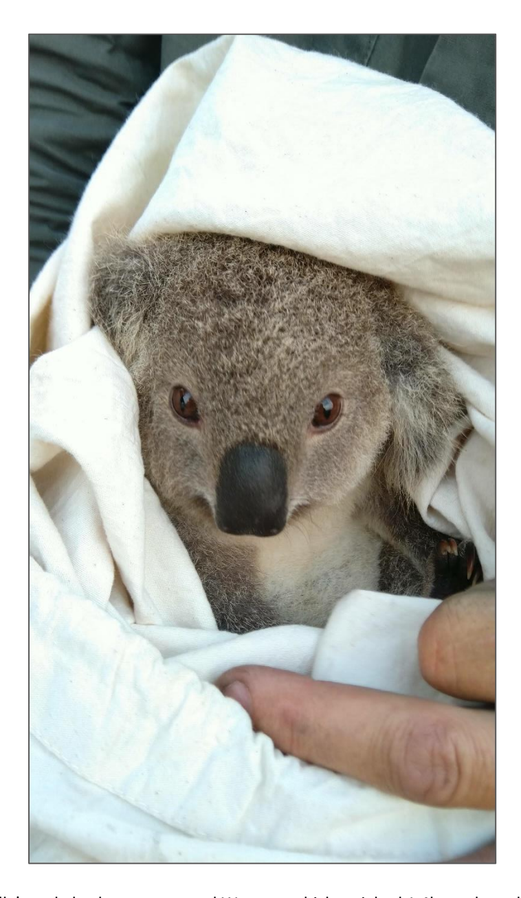
Figure 4. Image of Lilly's male back young, named Wooten, which weighed 1.4kg and was large enough to be fitted with a small ear tag.

It appears that the 'stepping stone' function of the retained scattered trees proved effective for Lilly and her offspring.