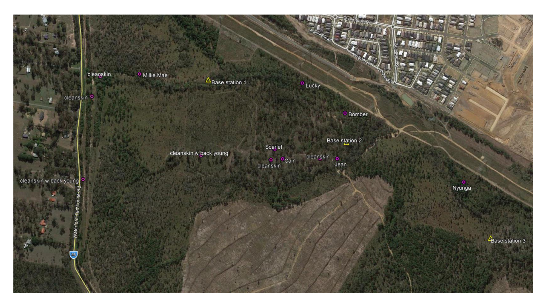
Figure 1. Plot of the initial locations of thirteen of the sixteen koalas that were sighted during the November 2019 fieldtrip. Note: all cleanskins were thought to be different individuals. (Figure 2 shows the locations of the other three sighted koalas).