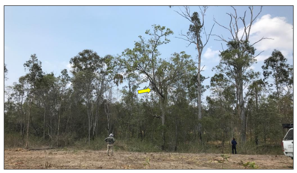
Figure 8. Picture showing Millie Mae's position prior to capture (yellow arrow), at the edge of the clearing at the north of the site (view is looking south from the clearing).

This new (cleanskin) koala was found sheltering in an Angophora tree on the northern branch of Quinzeh Creek, at the edge of the cleared area (Fig. 8). She was flagged down after a member of our team climbed the tree and encouraged her to descend to the point where the ground team could reach her with the flagging poles.