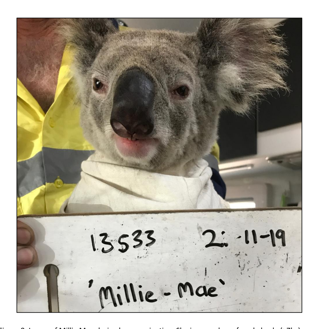
Figure 9. Image of Millie Mae during her examination. She is a very large female koala (>7kg); even her nose is large like that of most adult males.

Millie Mae was anaesthetised in an air-conditioned caravan on the site to facilitate her examination and tagging/collaring. She was found to be a very large adult female weighing 7.26kg; she was in fair condition (body score 7/10) and had an empty pouch. Her tooth wear suggested she is 4-8 years old so it is presumed that she has bred previously. Her eyes and rump did not show any obvious signs of chlamydial infection; swabs were collected to confirm this from laboratory testing (results pending). Millie Mae was given a unique coloured tag (Green "Q18") in her right ear to assist with visual determination of her identity on future fieldtrips.