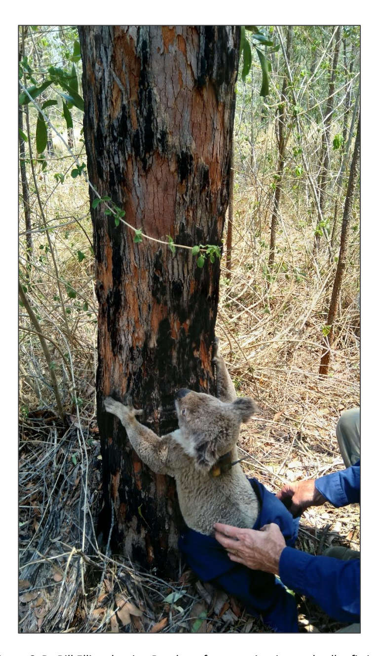
Figure 6. Dr Bill Ellis releasing Bomber after examination and collar fitting.